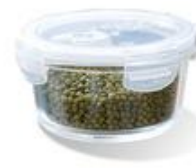
LHB-KR-410 410ml 0.36KG 130X130X70mm