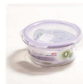
LHB-HR-950 950ML/0.62KG 179X179X76MM