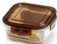
LHB-HSS-520 520ml 0.4KG 140X140X73mm