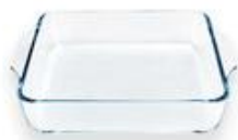
LHP-FP-1.5L 1500ml 0.8KG 240X200X50mm