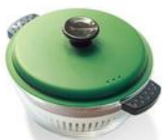
LHP-GT-1L 1200ml 0.6KG 205X170X79mm