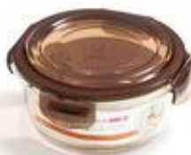
LHB-HRS-620 620ml 0.44KG 157X157X76mm