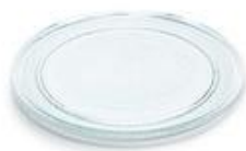
LHP-TP-245/700 无爪 245mm 0.7KG