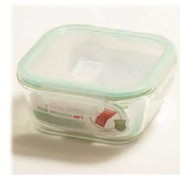
LHB-HS-800 800ML/0.54KG 156X156X72MM