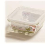
LHB-KS-570 570ML/0.47KG 136X136X65MM