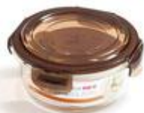
LHB-HRS-400 400ml 0.35KG 135X135X69mm