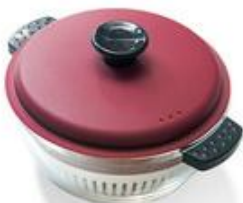
LHP-GT-1.5L 1500ml 0.77KG 223X187X85mm