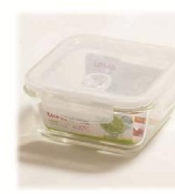
LHB-KS-690 690ML/0.53KG 145X145X65MM