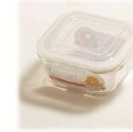
LHB-HSS-520 520ML/0.4KG 140X140X79MM