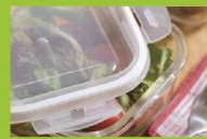
平边无色盖，白色硅胶密封圈 Flat transparent lid, white silicon seal ring