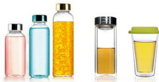
茶壶 茶杯 Teapot Teacup

冰箱、微波炉、电陶炉、电烤箱完全适用 It can be used for refrigerator, microwave oven, oven radiant-cooker