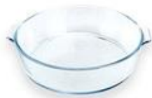
LHP-YH-1.6L 1600ml 0.76KG 230X210X60mm