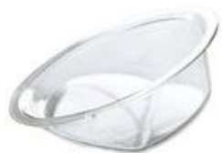
LHP-W0-324 Ø324mm 1.4KG