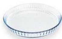
LHP-YP-270 1600ml 0.89KG Ø270X35mm