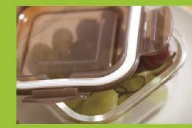
平边棕盖，白色硅胶密封圈 Flat brown lid, white silicon seal ring