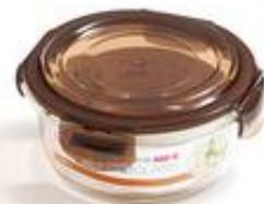
LHB-HRS-950 950ml 0.63KG 180X180X83mm