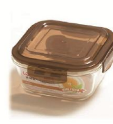
LHB-HSS-800 800ML/0.54KG 160X160X79MM