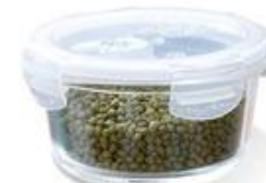
LHB-KR-840 840ml 0.62KG 167X167X77mm

冰箱、微波炉、电陶炉、电烤箱完全适用 It can be used for refrigerator, microwave oven, oven radiant-cooker