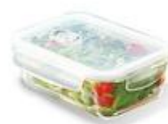
LHB-KL-330 330ml 0.33KG 139X105X56mm