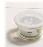
LHB-KR-840 840ML/0.62KG 167X167X77MM