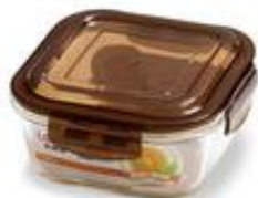
LHB-HSS-800 800ml 0.54KG 160X160X79mm