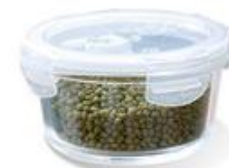
LHB-KR-570 570ml 0.43KG 152X152X69mm