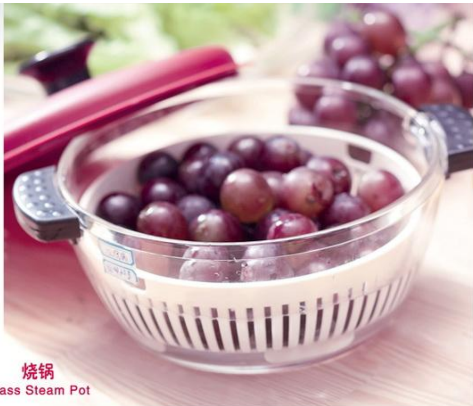
烧锅 Glass Steam Pot