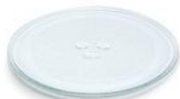
LHP-TP-255/600 有爪 255mm 0.6KG