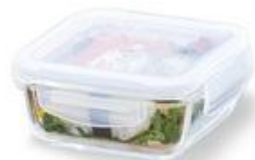
LHB-KS-690 690ml 0.53KG 145X145X68mm