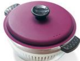
LHP-GT-2.5L 2500ml 0.76KG 241X204X90mm