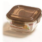
LHB-HSS-520 520ML/0.4KG 140X140X79MM