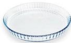
LHP-YP-300 2000ml 1.05KG Ø300X35mm