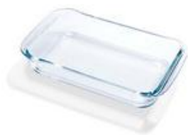
烤盘 Glass Bakeware