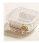
LHB-HSS-800 800ML/0.54KG 160X160X79MM