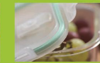
凸边系列，有负气孔，无色盖子，胶条为彩色 Convex edge, transparent lid with vent, colorful adhesive tape