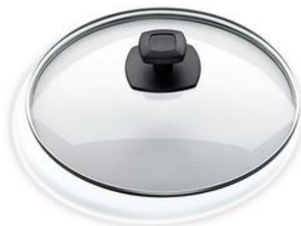
锅盖 Glass lid

锅盖系列产品主要包括：铸铝锅锅盖、 Pot covers material including that aluminum, 铸铁锅锅盖、白玉瓷器具用玻璃盖、其他器具用高硼硅玻璃锅盖 iron, white jade porcelain, and high borosilicate glass pot cover