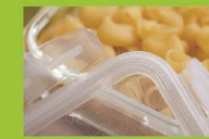
平边系列，有无色和棕色盖子两种，均为白色硅胶密封圈，有负气孔 Convex edge colorful adhesive tape, transparent colorless lid with vent