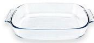
LHP-KP-2.9L 2900ml 1.3KG 344X223X61mm