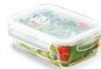
LHB-KL-570 570ml 0.43KG 167X118X62mm