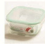
LHB-HS-520 520ML/0.4KG 137X137X76MM