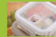
平边无色盖，白色硅胶密封圈，增加负气孔设计 Flat transparent lid, white silicon seal ring, lid is designed with vent