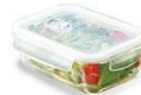
LHB-KL-840 840ml 0.6KG 194X133X67mm